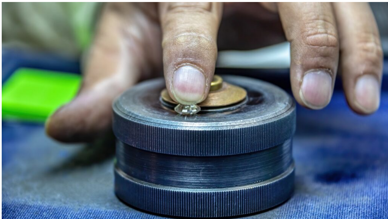
Main Image: The 7.5-Carat Polished Lab-Grown Diamond. (Greenlab)