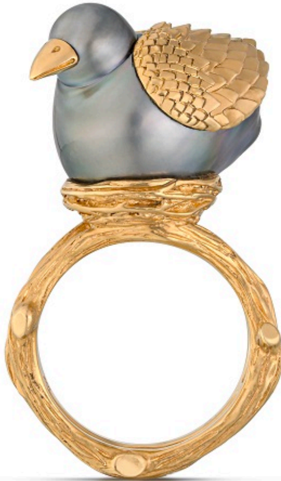
Birds Eye View ring by Fannie Thomas of Fannie Thomas Jewelry in 22-karat yellow gold with a bird-shaped cultured Tahitian baroque pearl.

First Place in Bridal Wear, and Best Use of Platinum Crown