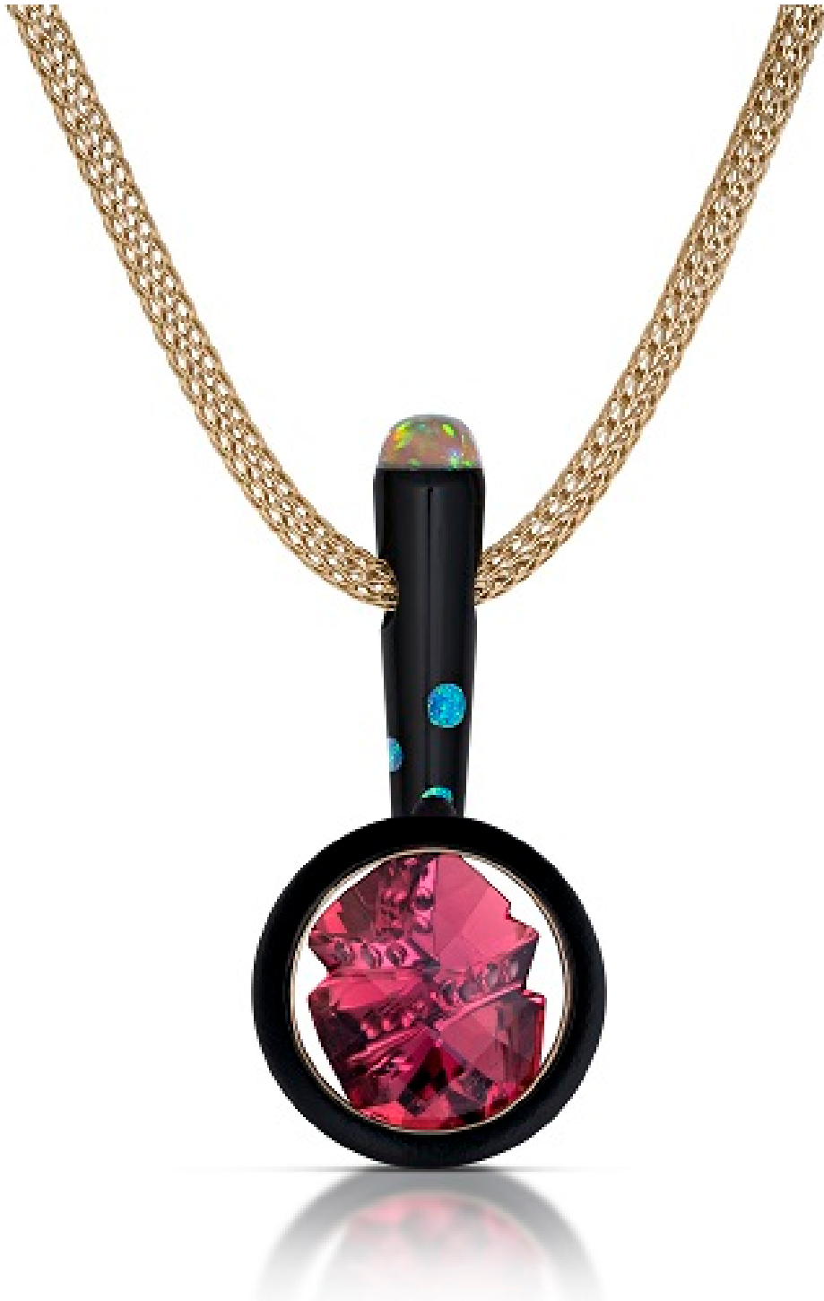
Pendulum/I Spy pendant necklace by Ai Van Pham of Gem & Gold Creations, featuring a fantasy-cut, 13.88-carat pink tourmaline, 14-karat yellow gold, black jade and opal inlay.