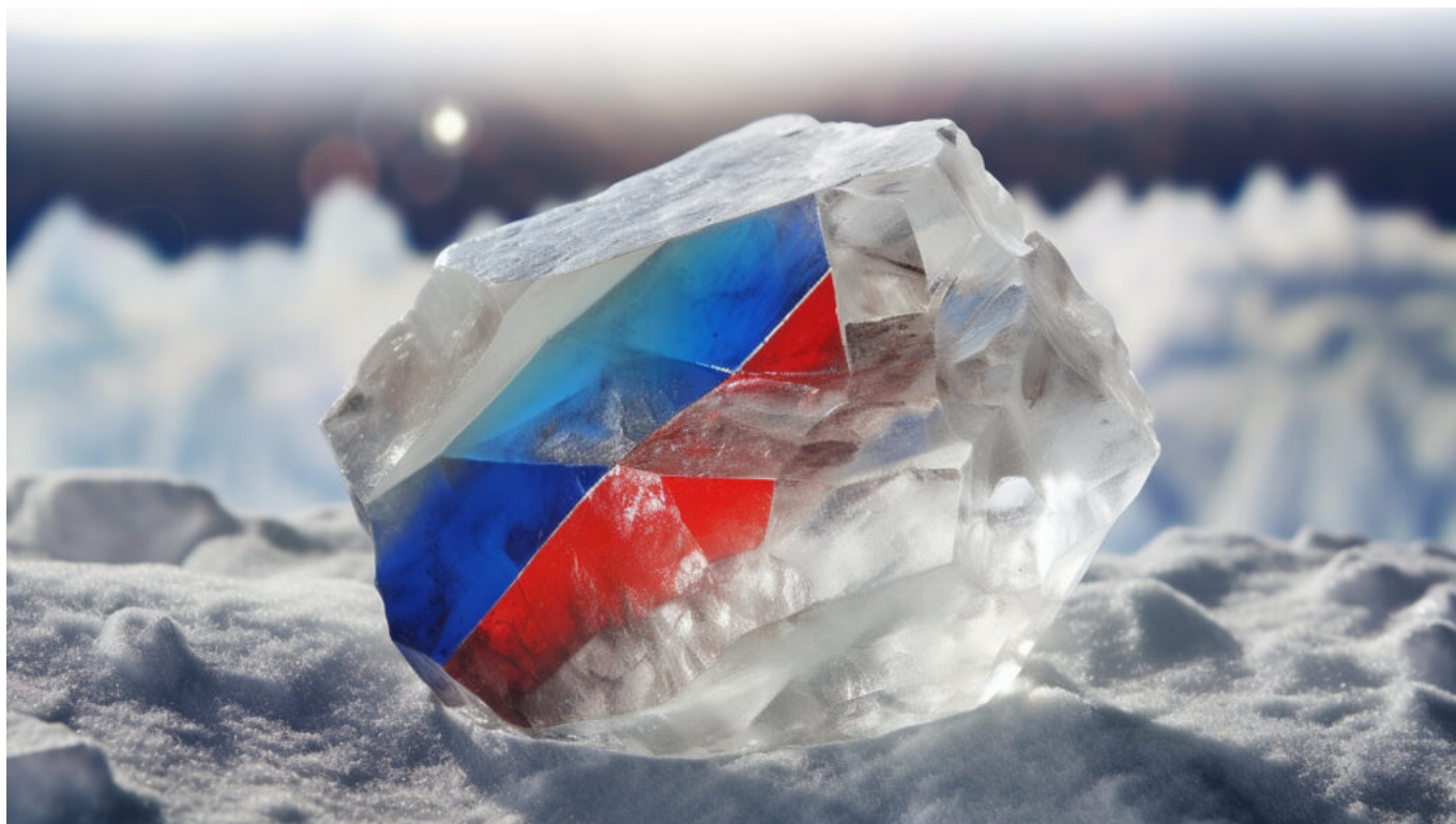
MAIN IMAGE: THE 390.7-CARAT ROUGH.